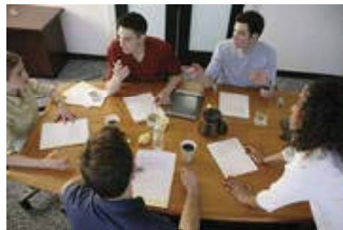
Group work and simulations