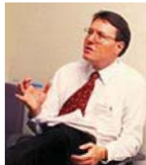
Review and discussion of techniques